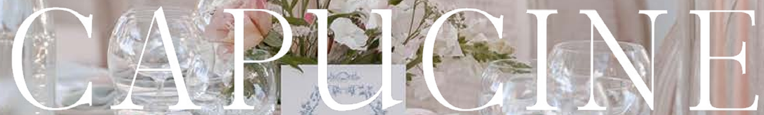
Table atelier floral